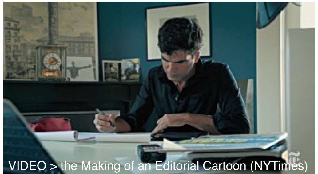
VIDEO > the Making of an Editorial Cartoon (NYTimes)